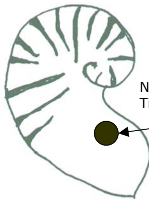
Name: Octopods (evidence) Time Range: Jurassic - Recent