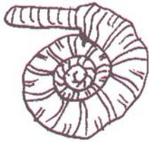
Name: Ammonite Time Range: Jurassic to Cretaceous