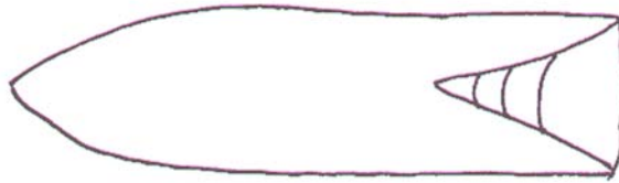
Name: Belemnite Time Range: Jurassic to Cretaceous