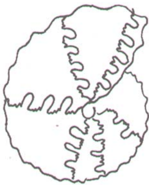
Name: Ceratites Time Range: Triassic