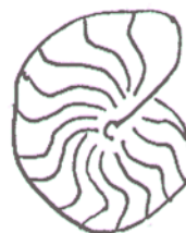
Name: Goniatite Time Range: Mississippian- Pennsylvanian